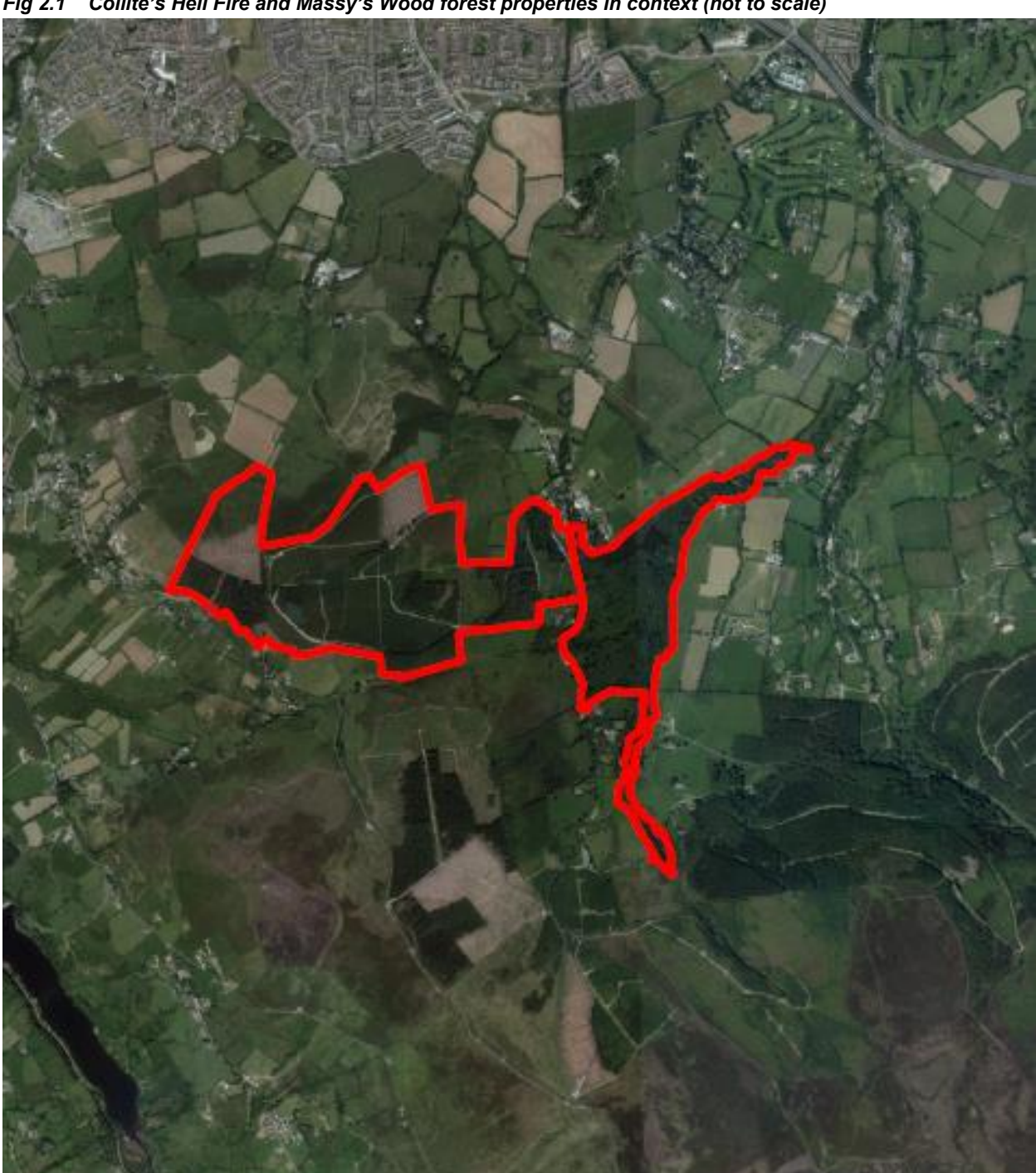
Fig 2.1 Coillte's Hell Fire and Massy's Wood forest properties in context (not to scale)

The application site is comprised of Coillte's Hell Fire and Massy's Wood forest properties, and sections of the R115 and R113 regional roads between the existing Hell Fire property entrance and the South Dublin urban area. The two forest properties have a combined area of c.152 ha.